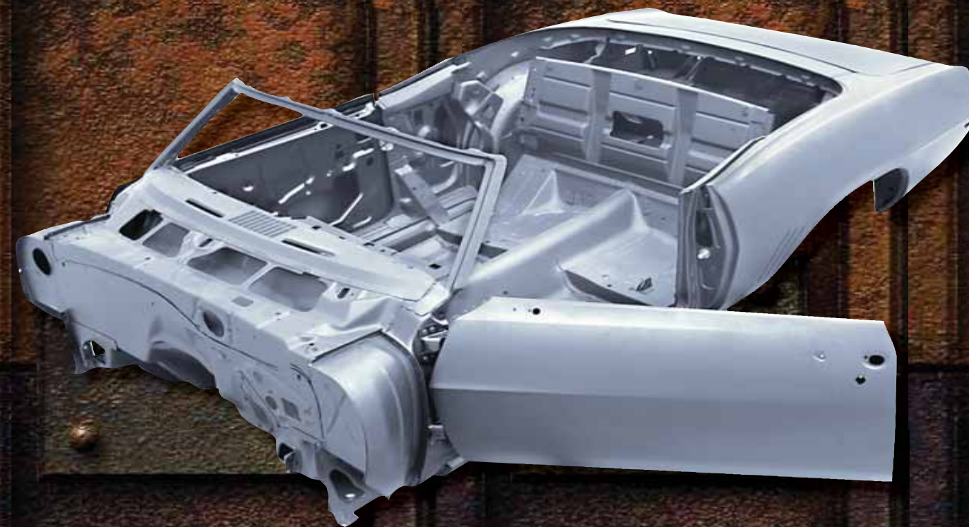
Camaro ® Bodies available in stock 1967 Coupe, 1969 Coupe & Convertible