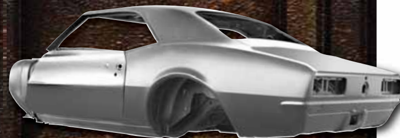
1967 Camaro® Coupe Replacement Body Shell