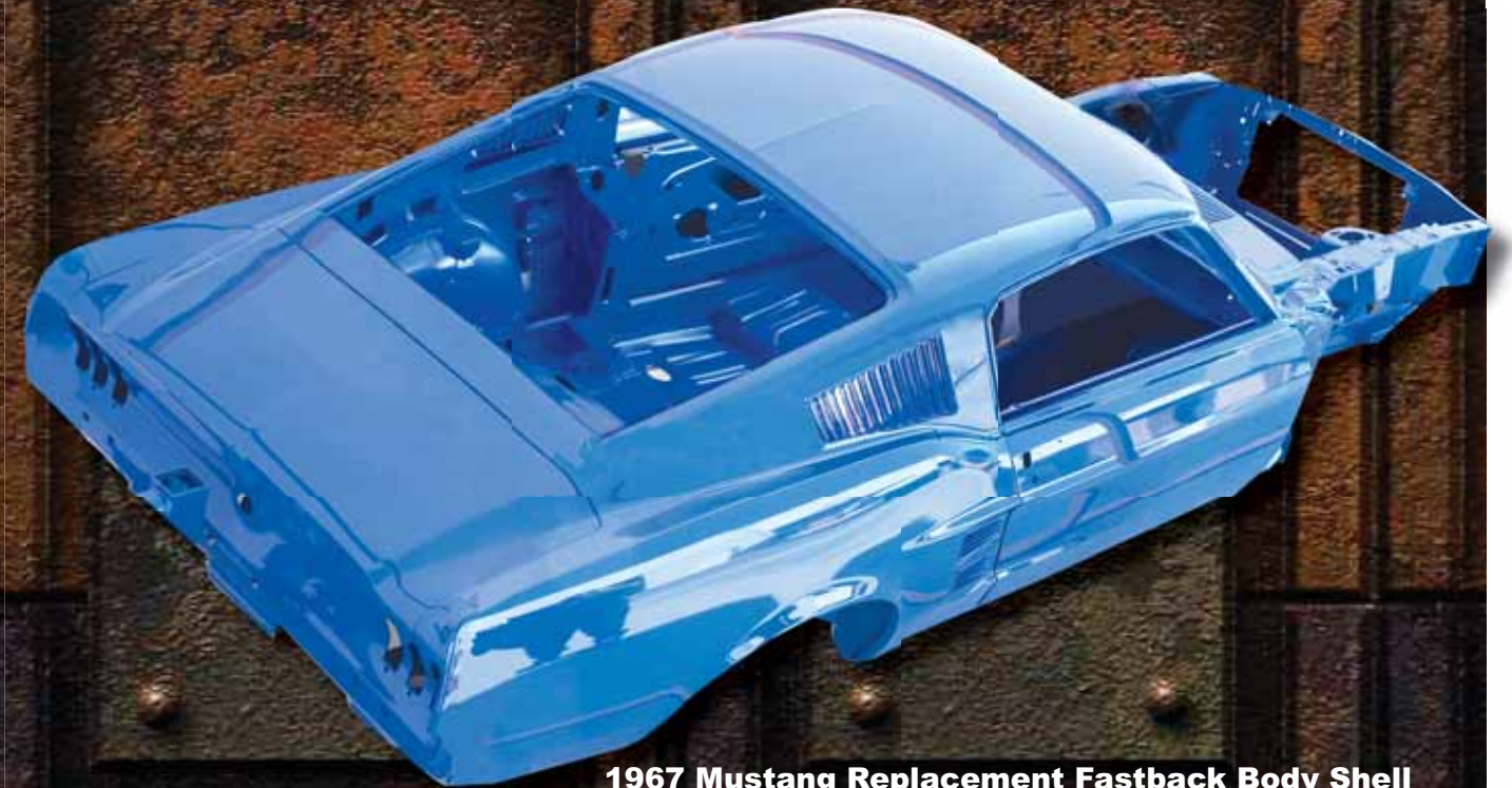
1967 Mustang Replacement Fastback Body Shell ** Does not come painted**