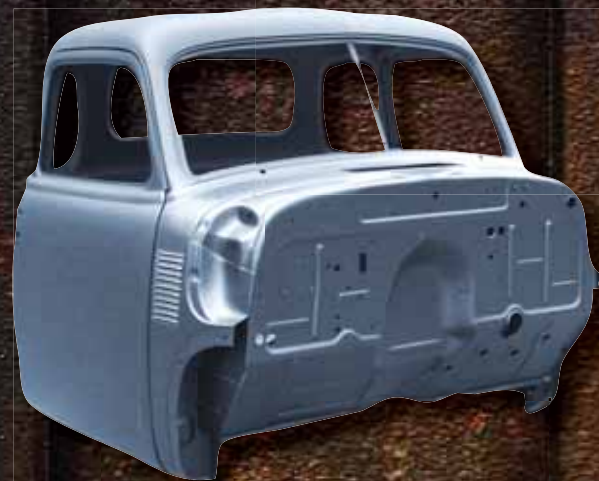
Chevy ® Truck Cab available in stock 1947 -1950 5 window cab

From the leading manufacturer of the finest reproduction parts in the automotive industry comes the innovation of the decade. We are pleased to announce the arrival of our Chevy Truck cab Replacement Body Shell, part number TR47PU for 1947-50 and 1952-54 cab, part number TR52PU . A Licensed GM restoration product complete with doors, steel dash assembly and cab floor braces. Truck cab is available in your choice of 3 or 5 window.