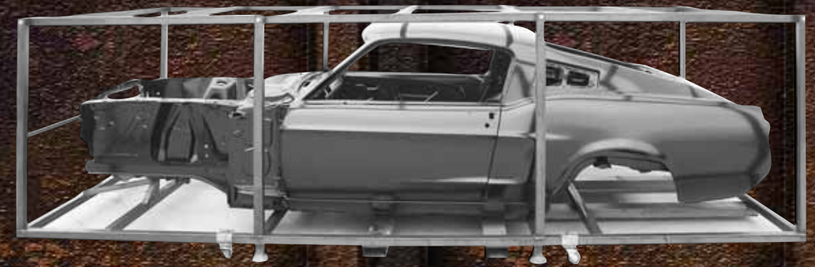
1968 Mustang Replacement Fastback Body Shell