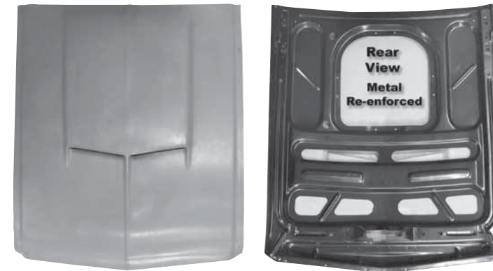
67-68 Mustang Fiberglass Hood w/steel inner brace

Modern technology mixed with classic domestic muscle. Who would ever think of those terms being used together? Hi-tech laser cutting is used to ensure the quality finish and fit and enthusiasts demand.