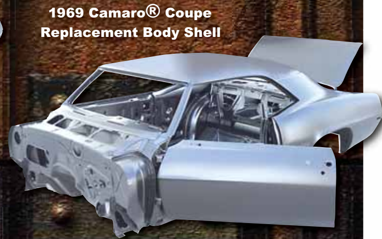
1969 Camaro® Coupe Replacement Body Shell