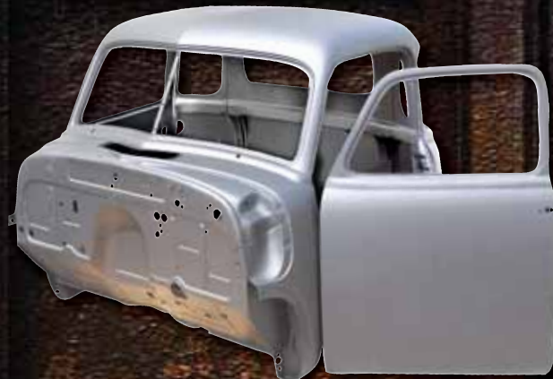
1947-50 Chevy® Pick Up Cab Replacement Body Shell