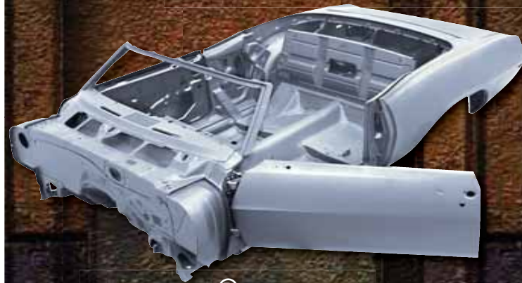
1969 Camaro® Convertible Replacement Body Shell

From the leading manufacturer of the finest reproduction parts in the automotive industry comes the innovation of the decade. We are pleased to announce the arrival of our Replacement Body Shells.